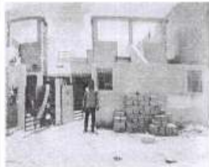
PHOTO OF THE PROPERTY

E-Auction Website: https://www.indianbankseauction.com